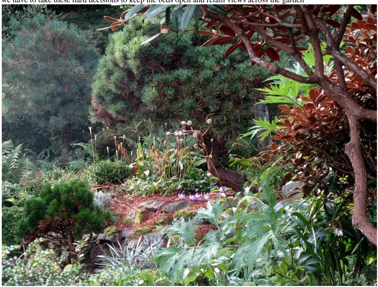
The view towards the 'peat wall' that the above branch blocked – now I can see some more Crocus nudiflorus.

Another branch had to come off Rhododendron elegantulum – it seems terrible to shred such beautiful foliage but we have to take these hard decisions to keep the beds open and retain views across the garden