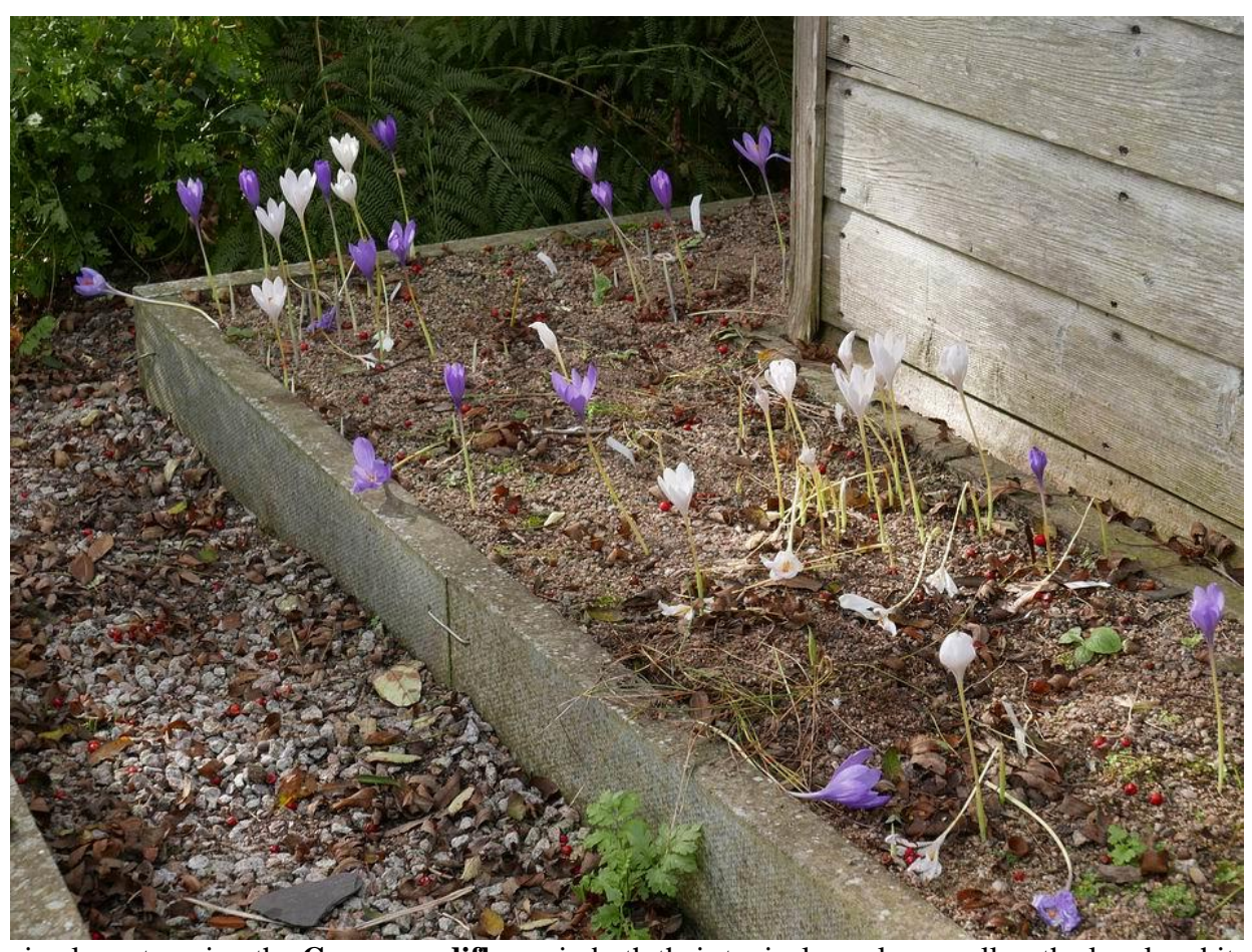
Moving in closer to enjoy the Crocus nudiflorus in both their typical purple as well as the lovely white forms.