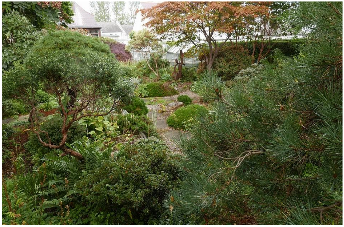
As bulbs come and go through the seasons, the structural plants, trees and shrubs, provide interest shape and form to the garden all the year round.