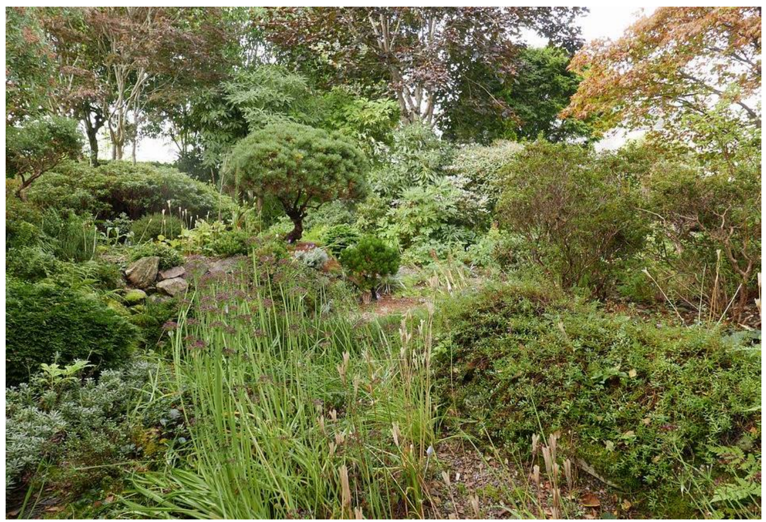
A view of the same bed from another view point also focuses in on the pine tree which I keep small by annual pruning of "candling" the growths. With so many trees and shrubs in a relatively small garden we need to do regular trimming and cutting or else we would disappear into a forest with no room for under-planting.