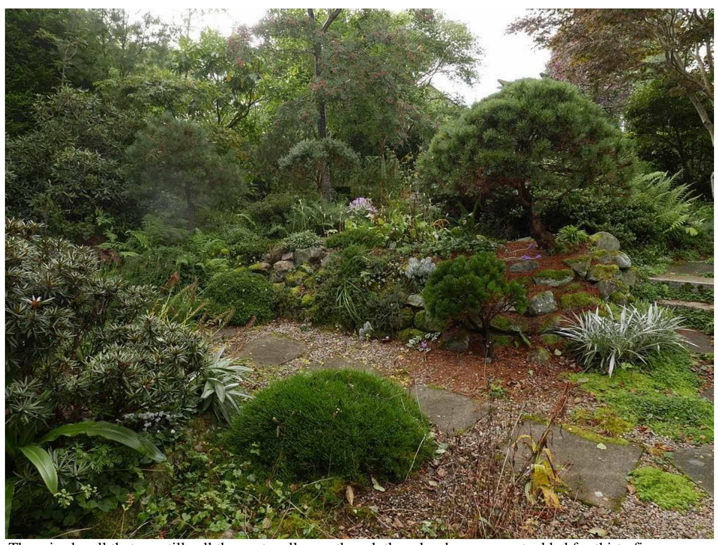
The raised wall that we still call the peat wall even though there has been no peat added for thirty five years contains a mixture of shrubs and bulbous plants.