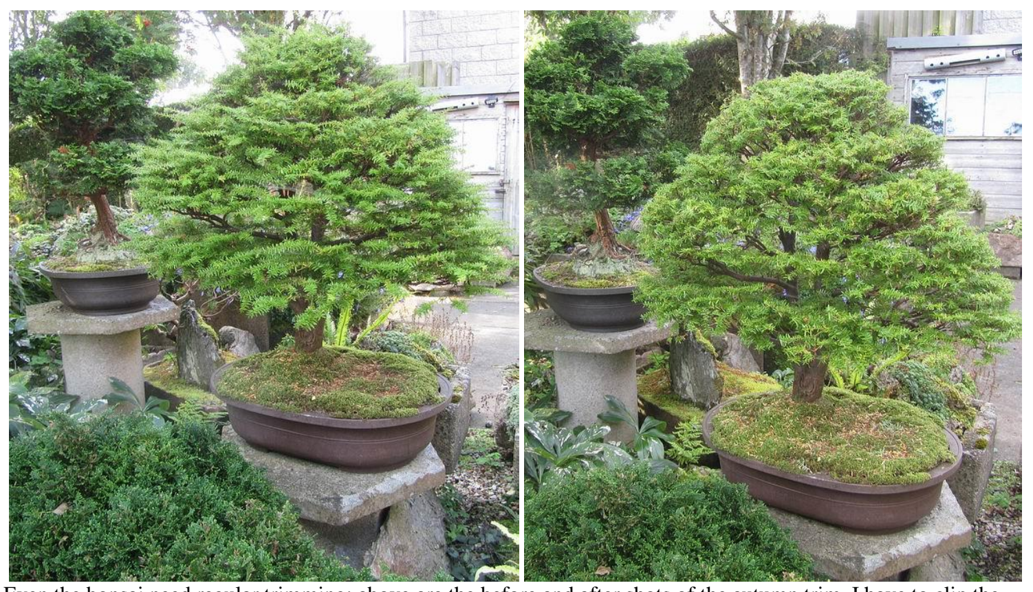
Even the bonsai need regular trimming; above are the before and after shots of the autumn trim. I have to clip the foliage of this tree twice a year and next spring, ideally around March/April, I will have to prune the roots as well. I have not pruned the roots of this tree for some years and I know it needs done when I can see the root growth forcing the potting ball upwards out of the pot.