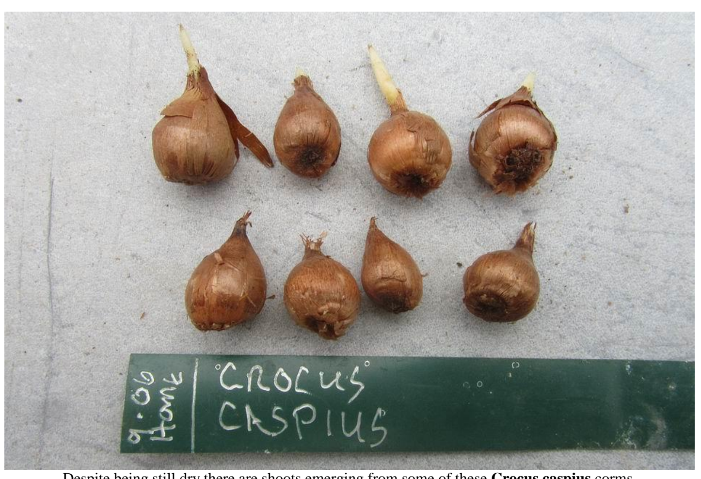
Despite being still dry there are shoots emerging from some of these Crocus caspius corms.