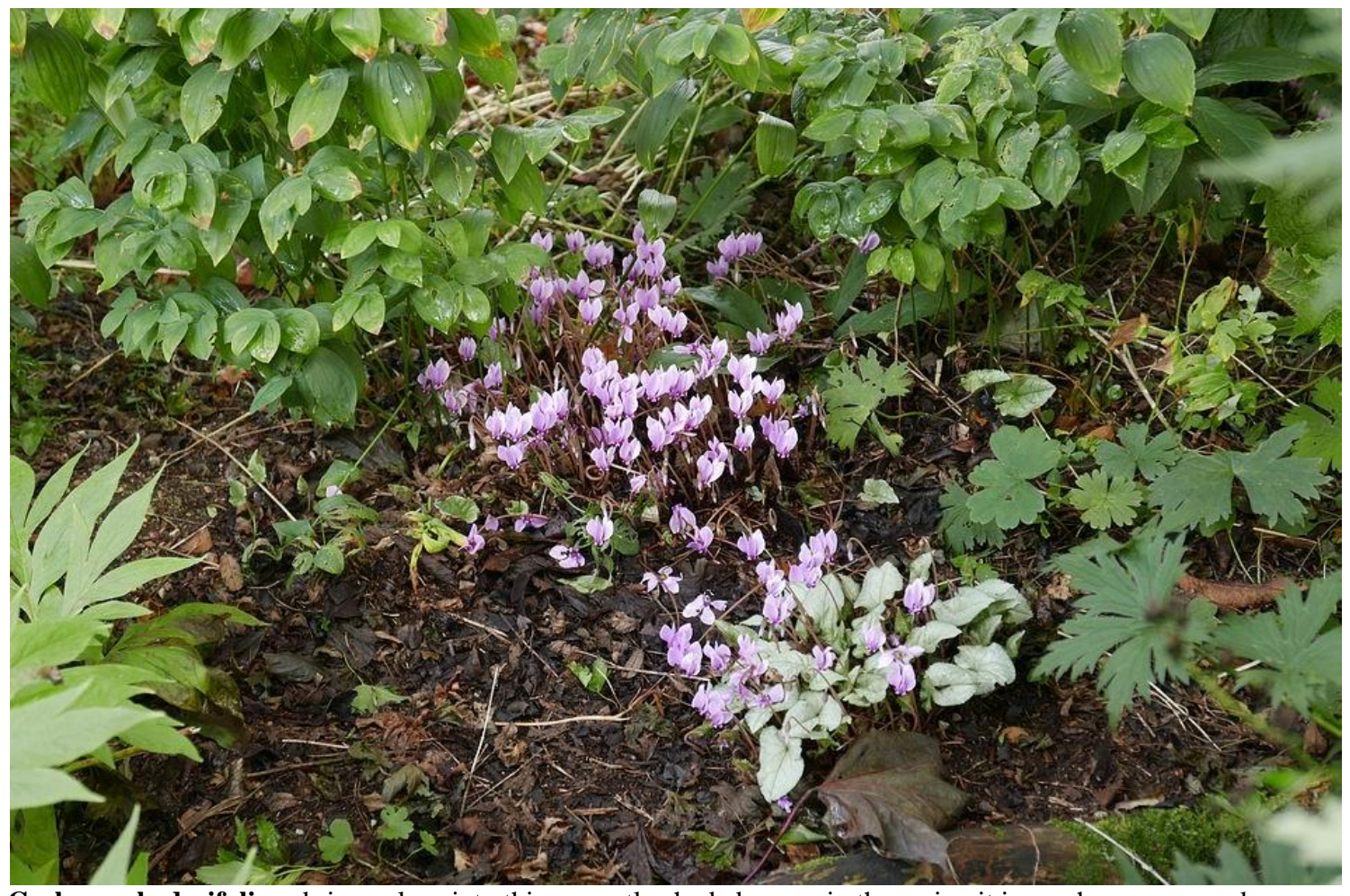
Cyclamen hederifolium bring colour into this currently shaded area – in the spring it is much more open above before the leaves come on the trees, mostly Acers here.