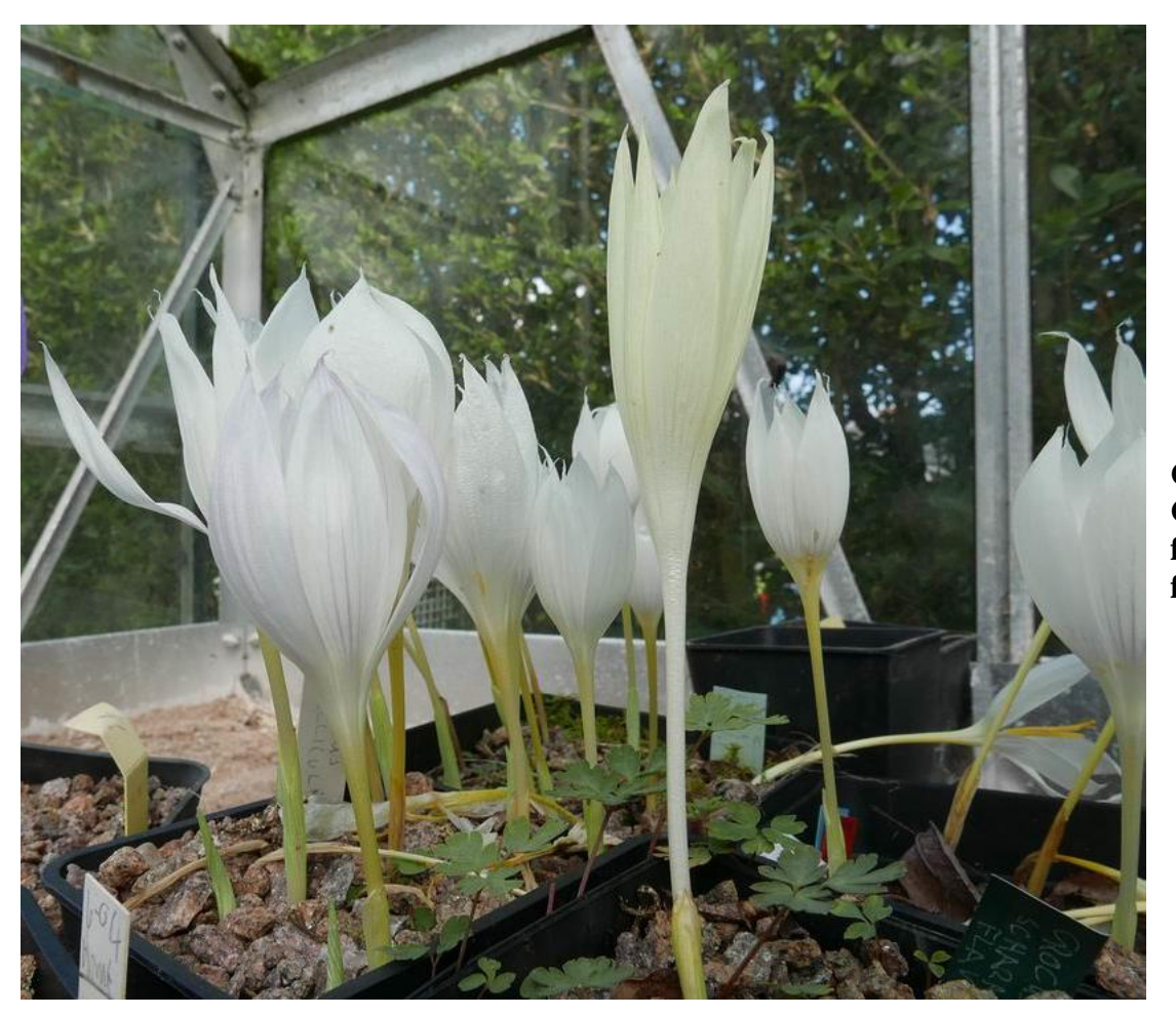
Crocus vallicola with Crocus scharojanii flavus in the foreground