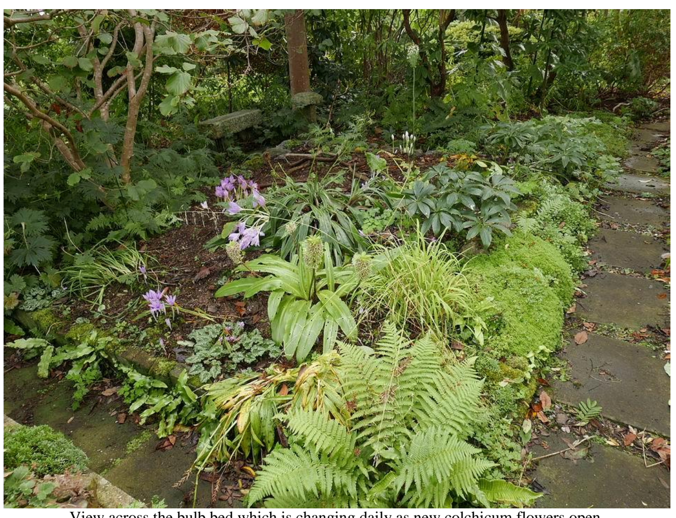
View across the bulb bed which is changing daily as new colchicum flowers open.