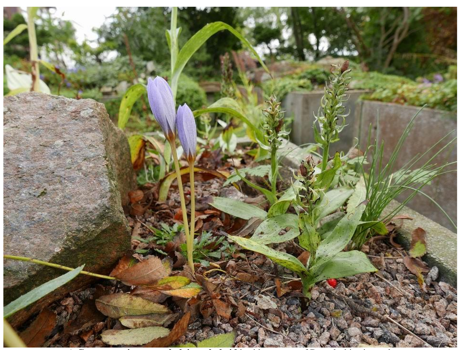
A Crocus speciosus xantholaimos hybrid beside a group of Dactylorhiza in seed.