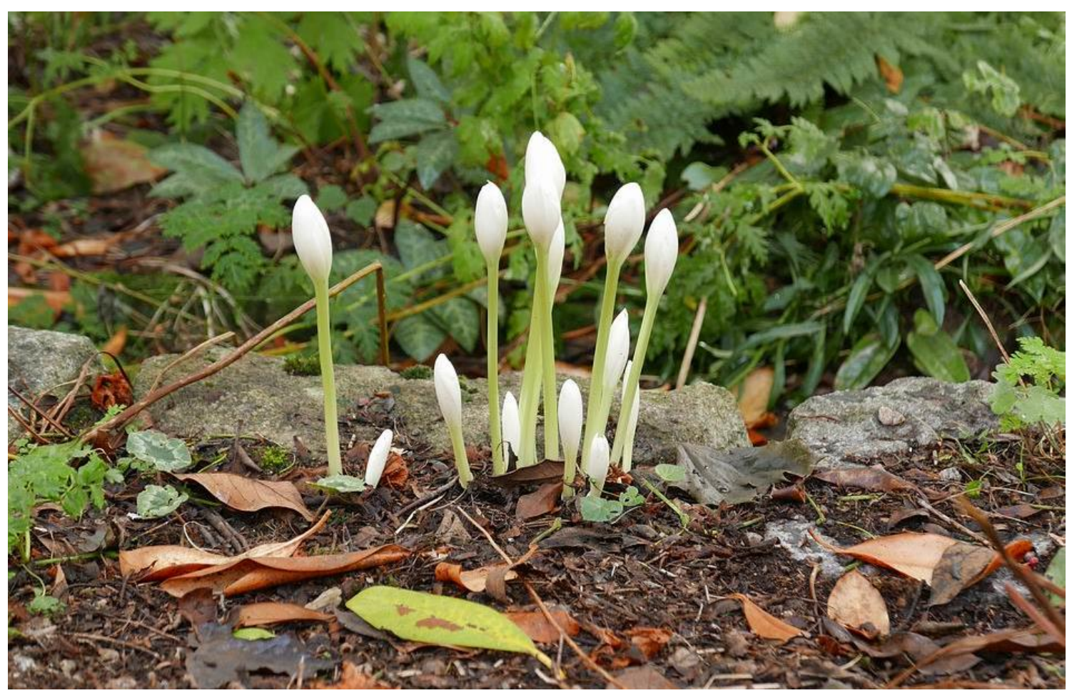
Colchicum speciosum album flowers have yet to open but if we get some nice weather in the coming week I expect to see their wide-open wineglass structure displaying in the sunshine.