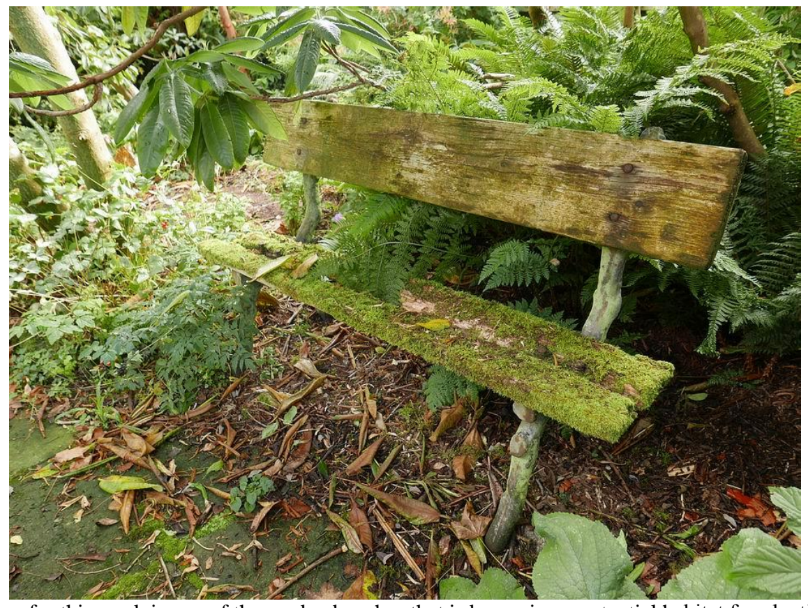
My final image for this week is one of the garden benches that is becoming a potential habitat for planting......