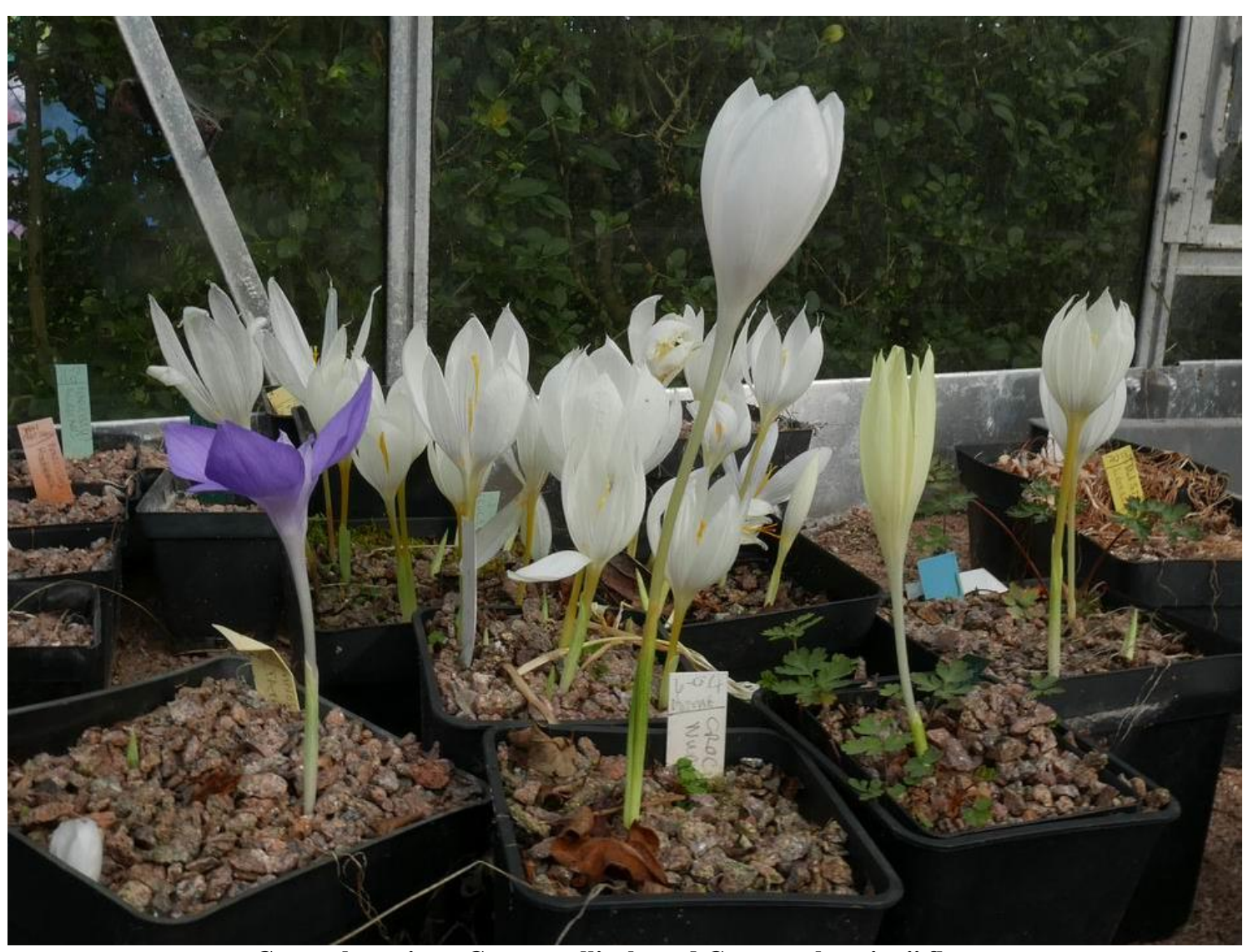
Crocus banaticus, Crocus vallicola and Crocus scharojanii flavus

More pots of crocus from the open frame and brought under glass to allow the flowers to enjoy a bit of extra warmth and encourage pollination, fertilisation and seed set.