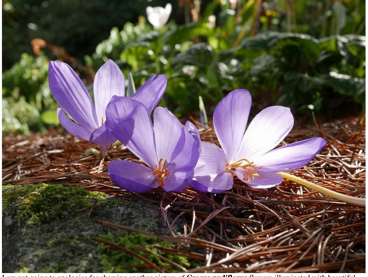
I am not going to apologise for showing another picture of Crocus nudiflorus flowers illuminated with beautiful back lighting.