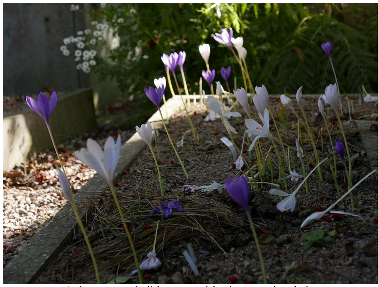
And one more as the light passes and the plunge goes into shade.